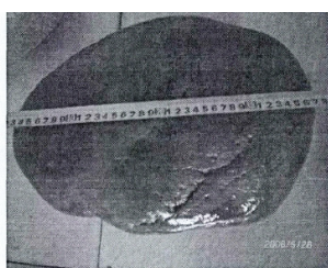
(b) Single sandy cobble