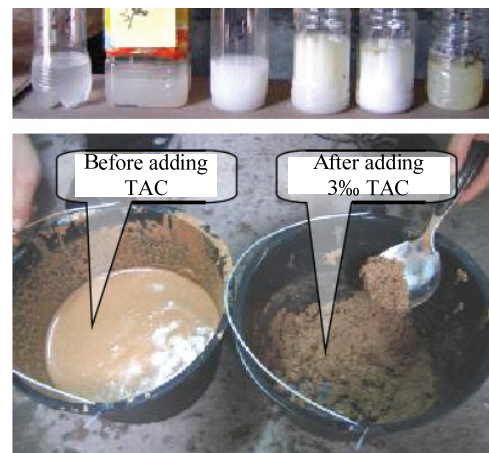
Fig.3 The appearance and experimental results of TAC polymer

It is current advanced method to improve the properties of the soil, which is injecting foams that are made by special foaming agent and compressed air. At present, domestic shield tunneling mainly uses bentonite and foam as muck improvement admixture. But, water-absorbent resin and water soluble polymer materials are used relatively rare. TAC polymer is creatively introduced into Kuizu shield tunneling in water-rich sandy stratum. TAC polymer has excellent hydrophilicity and significant effect of increasing viscosity. It can improve fluidity and water-tightness of water-rich sandy stratum and prevent the incrusting of cutter disc. This admixture is well applied in Kuizu shield tunneling in water-rich sandy cobble stratum. The appearance and experimental results of TAC polymer are shown in Figure 3.