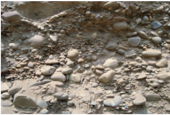
Fig.2 Sandy Cobble Stratum with High Content of Big-sized Cobble