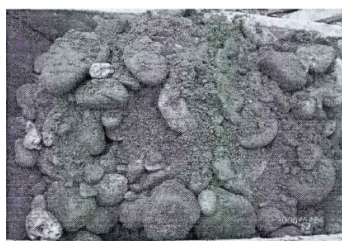
(a) Sandy cobble soil after digging and mixing

soil. Figure1 is sandy cobble soil dug out in shield tunneling of Chengdu Metro Line.