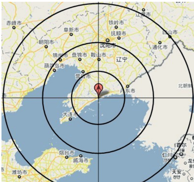
Figure 1: Radiation area of research scope

The study is centring on city of Zhuanghe, scope of I, II, III area surrounding, I area is as per radius of 100 kms, II area is as per radius of 100~300 kms, III area is as per radius of 300~500 kms, and IV area are the cities along the “east-railway”.