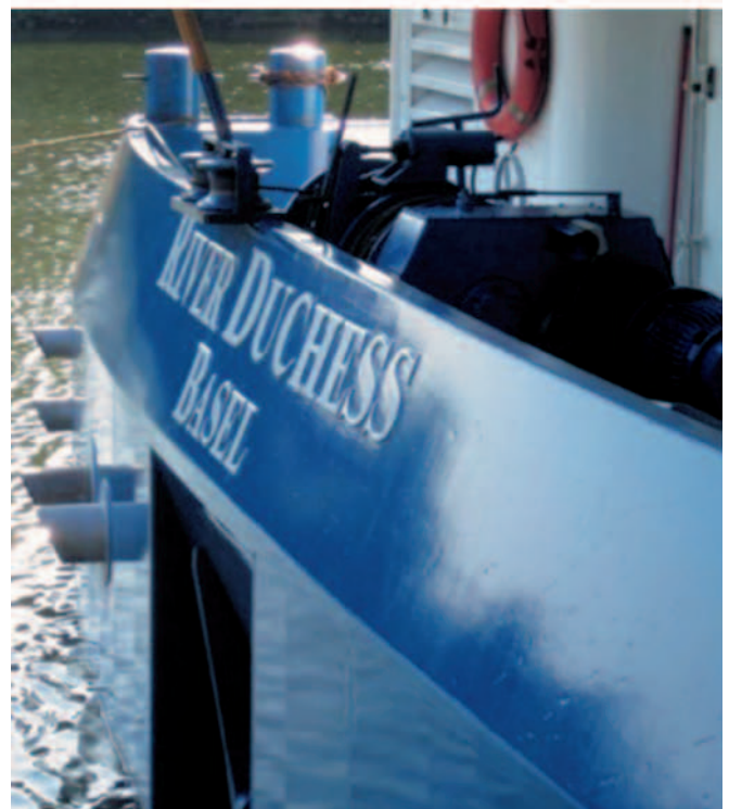
Fig.3. Examples of the anchoring and mooring equipment arranged in the stern part of various inland waterways ships .