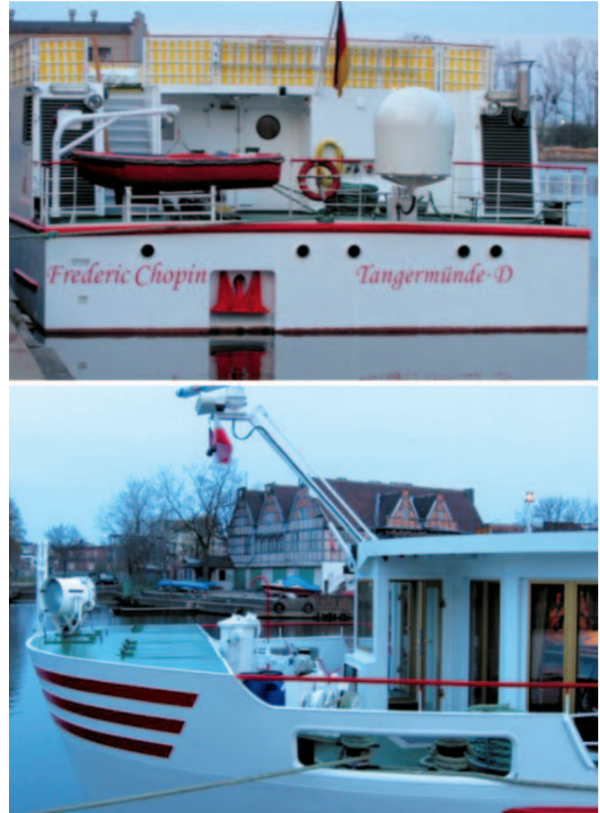
Fig.1. Anchoring and mooring equipment arranged in the bow and stern part of the tourist ship „Frederic Chopin” .