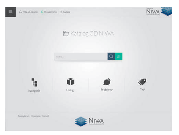
Figure 2. Example of the system interface

An integral part of the system, that is the most visible, is the user interface. It was composed as a Single Page Application (SPA) that communicates with a server using AJAX (AmplifyJS). This technology fulfills requirements on the application effectiveness, and minimizes usage of the resources during the information exchange using JSON. An example of the interface is shown in Figure 2.